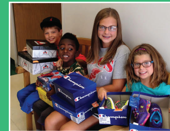
Local students proudly show the shoes they donated for other children to Soles for Christ during the 2014 program.